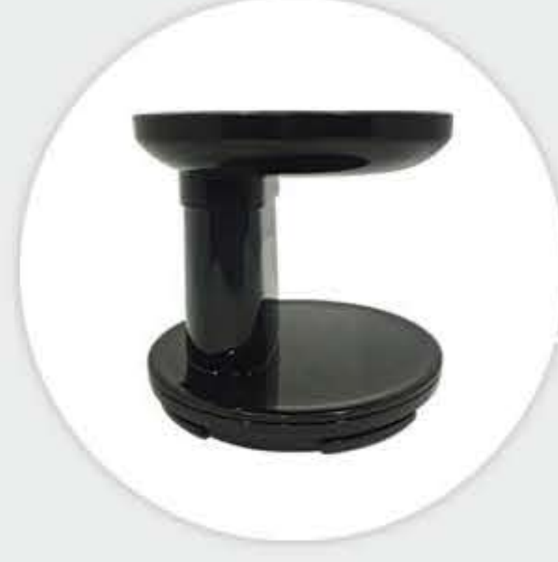
Tray & Cup Lid